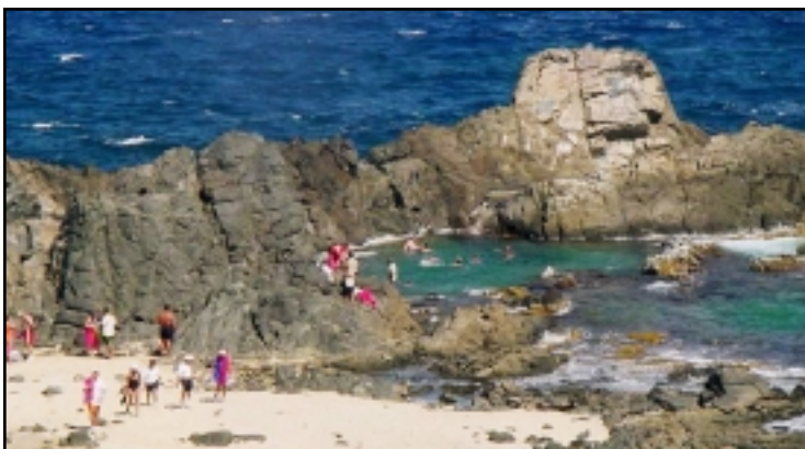
How lovely! A private pool reserved especially for HHF!

Aruba offers many adventures and surprises as some of our golfers found out as they found themselves sharing the green with Bill Gates and his guests.