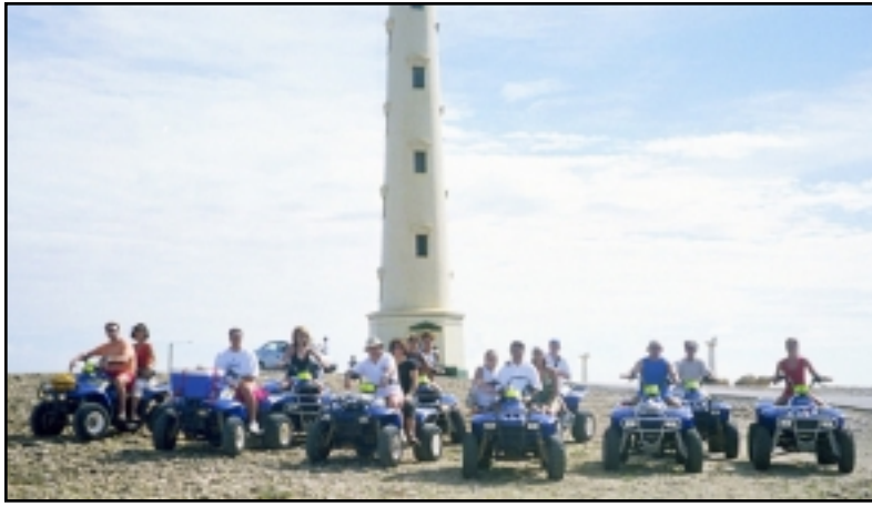
Searching for the fountain of youth on ATV's in Aruba